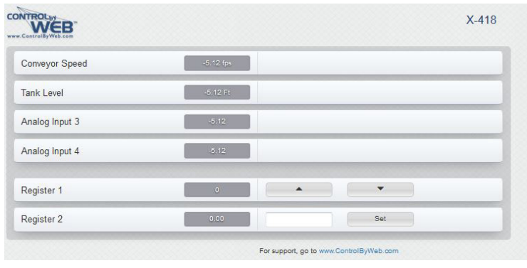
Example X-418 Control Page