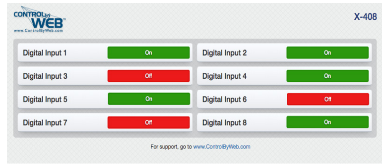
Example Control Page